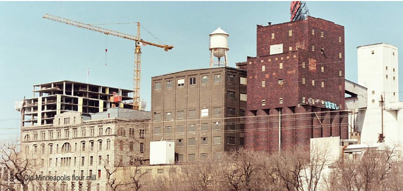
Old Minneapolis flour mill