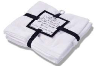
Custom Retail Options

Recloseable poly bags can be used to not only hang towel packs from a wicket, but protect the towels from dirt and debris from outside sources.