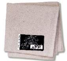
Natural Towel Options