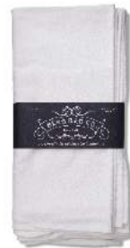
Standard Paper Band

3" high paper bands securely wrap towel packs so they can be neatly stacked on retail shelves. Customers are able to see and feel the quality of the towels without disturbing the integrity of the pack. Plus, our flour sack towel story can be found on the back of the band!